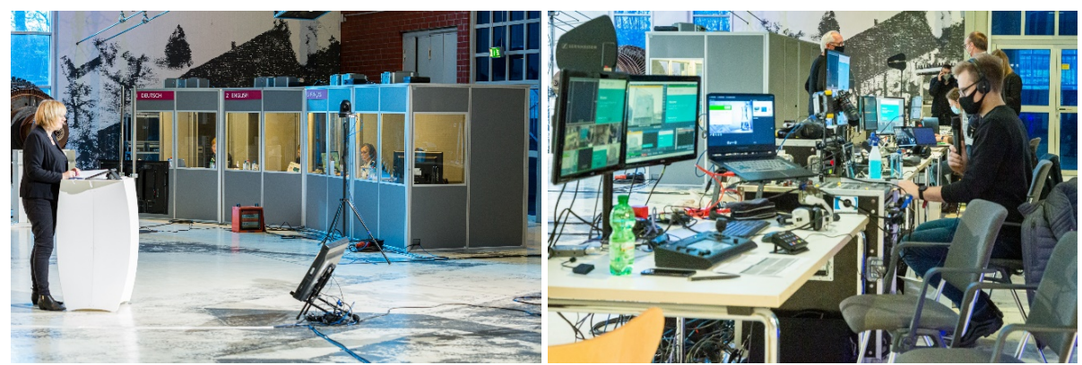
Impressions from the 'Energy Hall' control centre (DASA, Dortmund) including technical equipment and interpreter booths

All lectures and the recording of the livestream can be accessed on the <u>BAuA website</u>. A few visual impressions of the conference are also attached below.