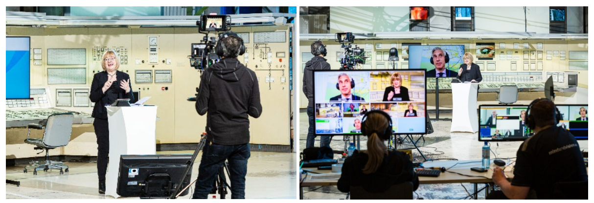
Impressions of moderation and recording of contributions